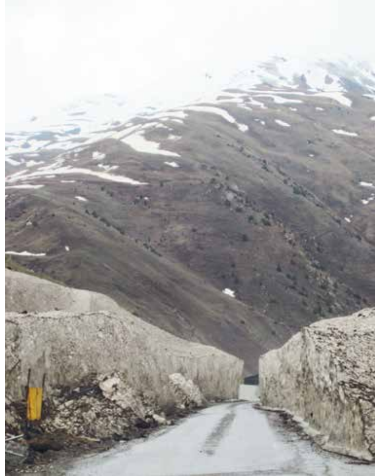
The road from Panjakent in the north to the capital Dushanbe in the south is often inaccessible in the winter.

The children's corners are currently sparsely equipped.